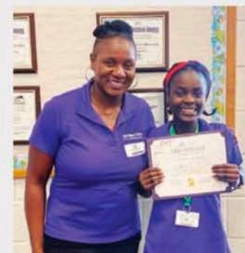
WOMEN FROM THE COMMUNITY TEACH VITAL LIFE SKILLS TO YOUNG GIRLS THROUGH THE JUNIOR WOMEN OF INITIATIVE PROGRAM.

Workshops are designed to develop and improve public speaking skills, as well as enhance interpersonal skills through manners, social etiquette, and professional behavior. Mentors are strong, successful women from the local community who volunteer their time helping prepare the young girls for a life in which they can be productive and make a difference in their community. ( bgccc.com ) —G.S.